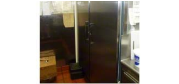
Victory double door refrigerator