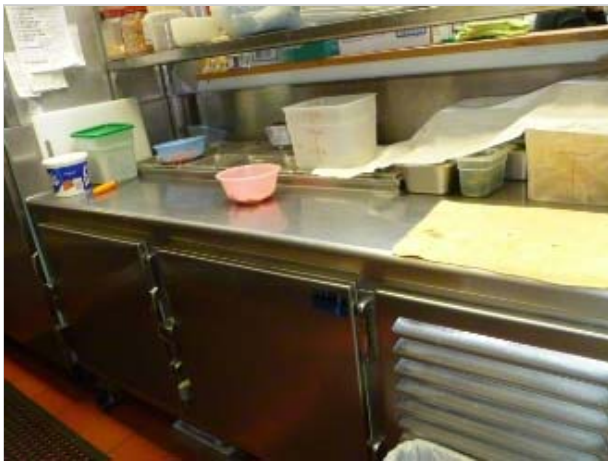
Prep table and under counter refrig