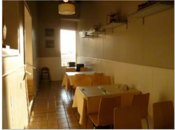
Lower Dining Room