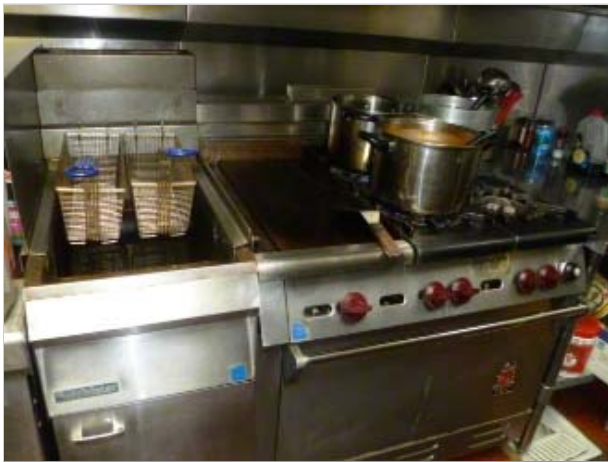
Deep fryer, 4 burner, skillet